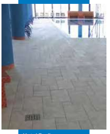
Hotel Radison -Bükkfürdő - Hungary