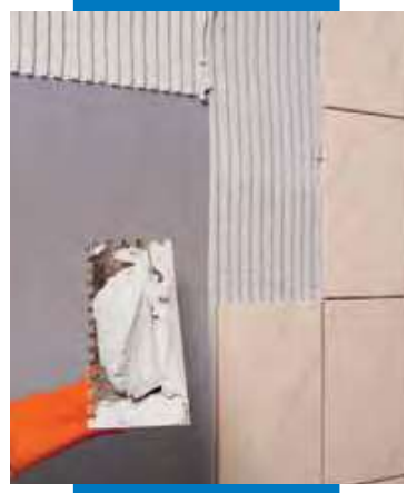
Mrázovka Tunnel -Prague -Czech Republic