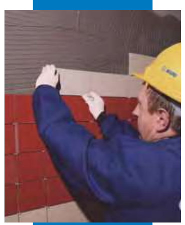
Fixing ceramic tiles on walls working from the top to the bottom