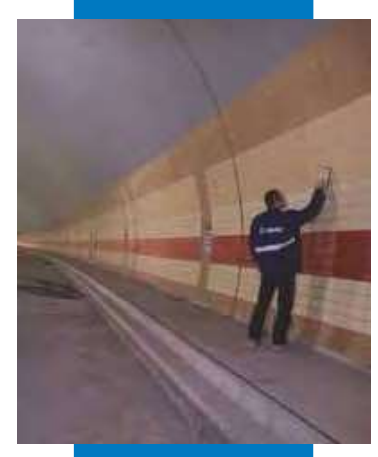
Mrázovka Tunnel -Prague -Czech Republic