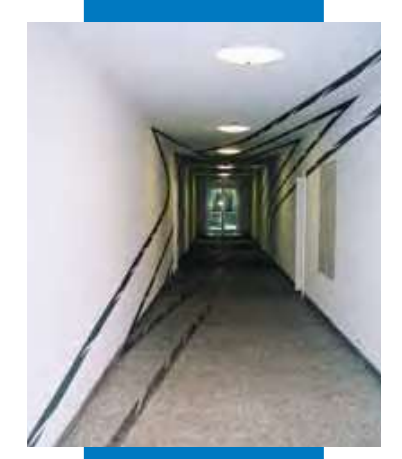
Alliance insurance offices - Munich -Germany